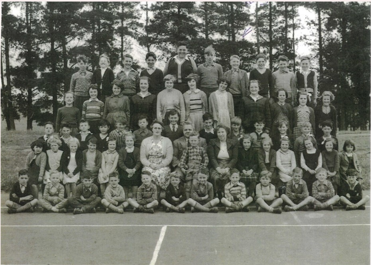
Compton Primary School Photo 1954